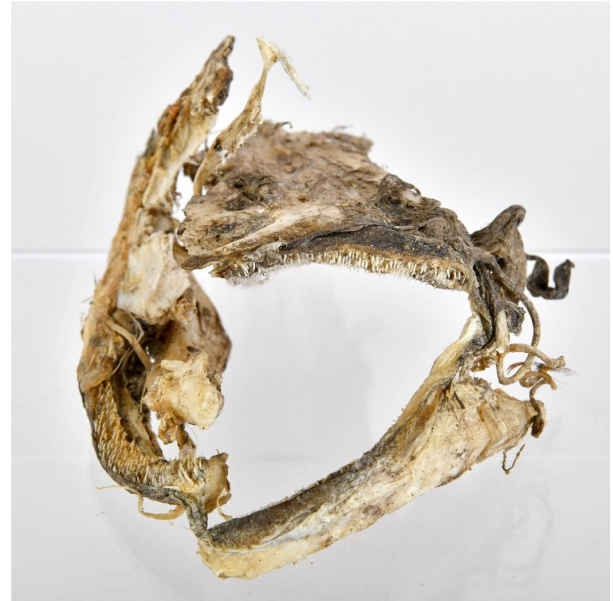
S. glanis , estimated min 45 cm (Lanžhot 2022)