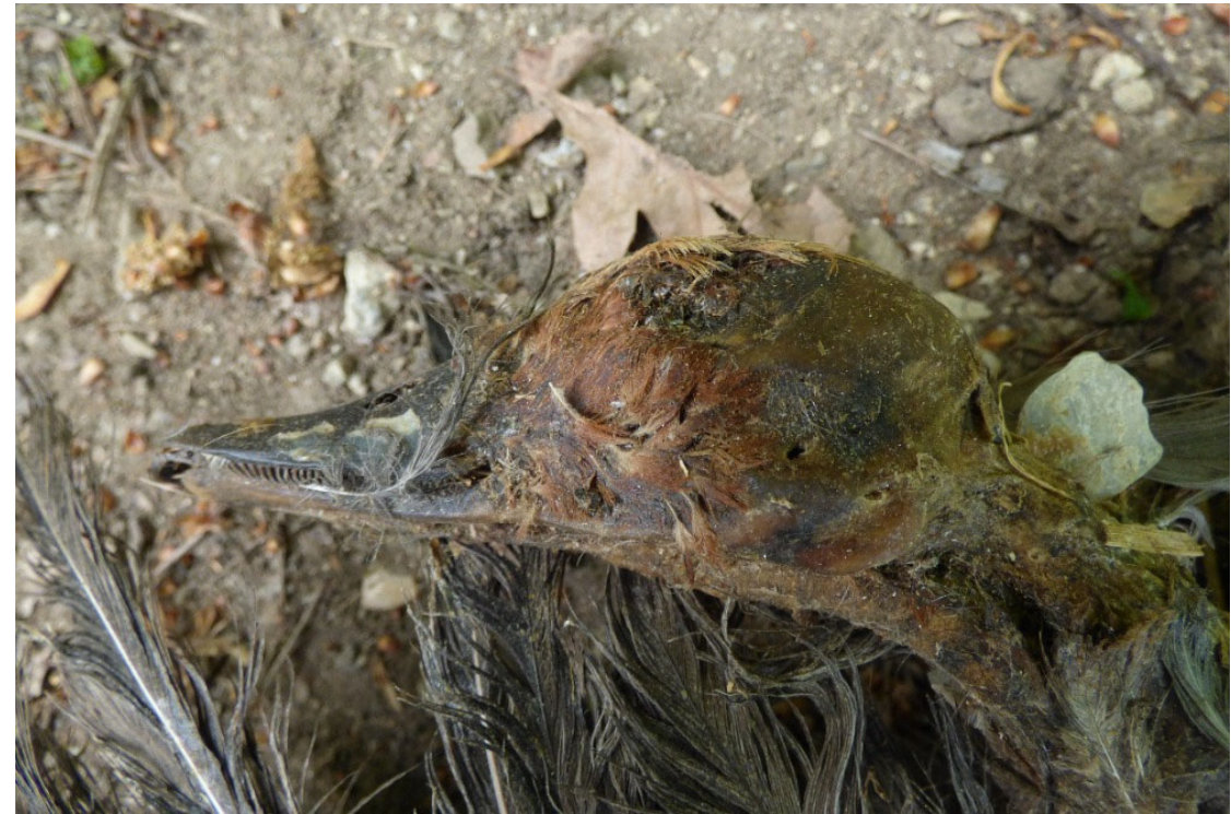
1 – Anas penelope (Lednice 2020), 2 – Abramis sp. 40 cm (Lanžhot 2021)