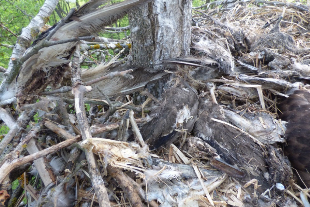
1 – 4 E. lucius (Lanžhot 2022), 2 – 9 E. lucius (Lednice 2020), 3 and 4 numerous birds (Lednice 2020)